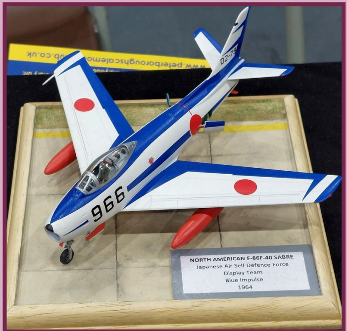
A very nice example of a colourful Japanese Air Self Defence Force North American F-86F-40 Sabre in the markings of the JASDF 'Blue Impulse' Aerobatic Display Team.