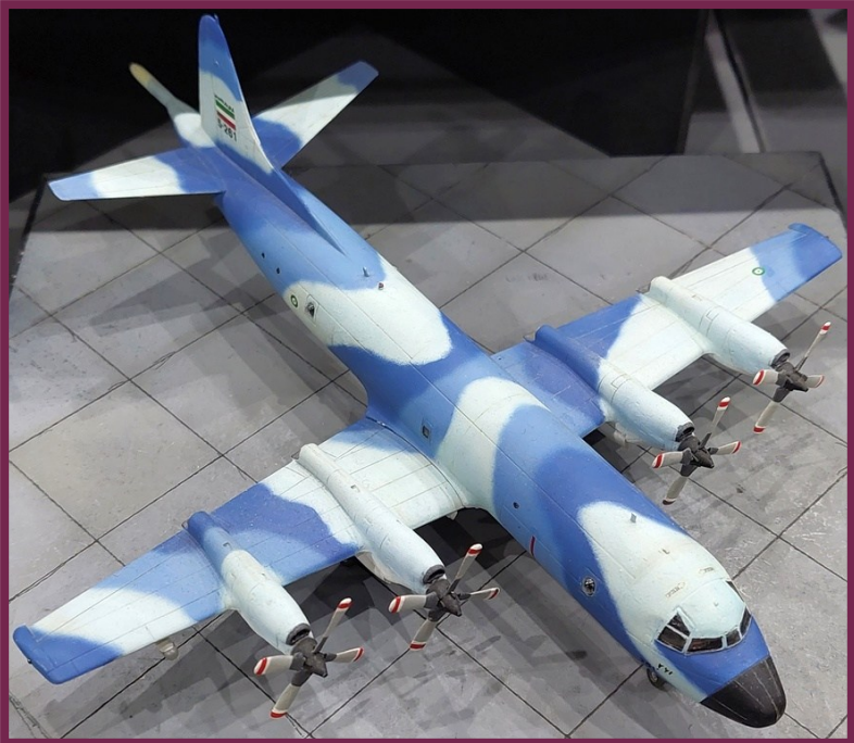
An excellent example of the LS 1:144 scale kit of the Lockheed P-3F Orion, finished in the attractive four-colour camouflage scheme applied to aircraft in Iranian Service.