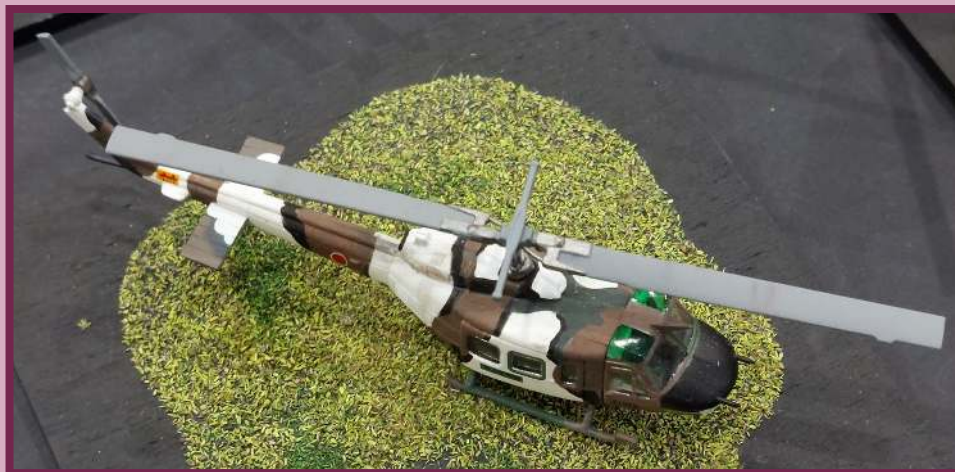
This Bell UH-1H Huey helicopter, probably utilized a F-Toys or Tomytec 1:144 scale model kit to reproduce a Japanese Ground Self Defence Force (JGSDF) machine in winter camouflage.