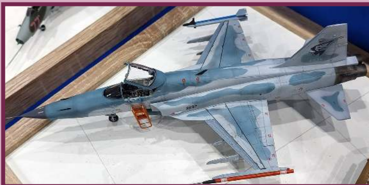
This AFV Club 1:48 Northrop F-5E Tiger II, in Royal Thai Air Force markings, was spotted on the Aggressor and Adversary SIG stand.

A very nice example of the classic Grumman F-14A Tomcat in the Islamic Republic of Iran Air Force (IRIAF) 'Asia Minor' camouflage scheme and markings, which had been reproduced using the Hobby Boss kit, was observed on one of the displays in the Overseas Branch Section at SMW'24.