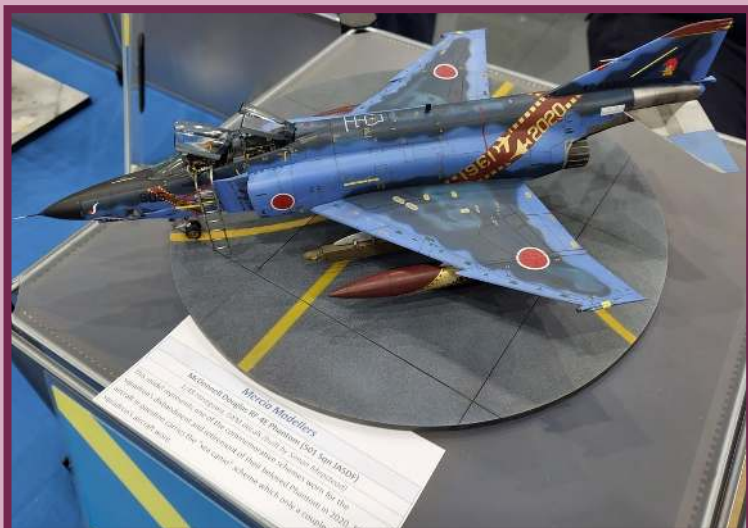
This superb Hasegawa 1:48 scale model of a McDD RF-4E Phantom II portrayed an aircraft operated by 501 Squadron of the JASDF, and sported the special markings applied to this aircraft to commemorate the 50 th Anniversary of the JASDF in 2004.