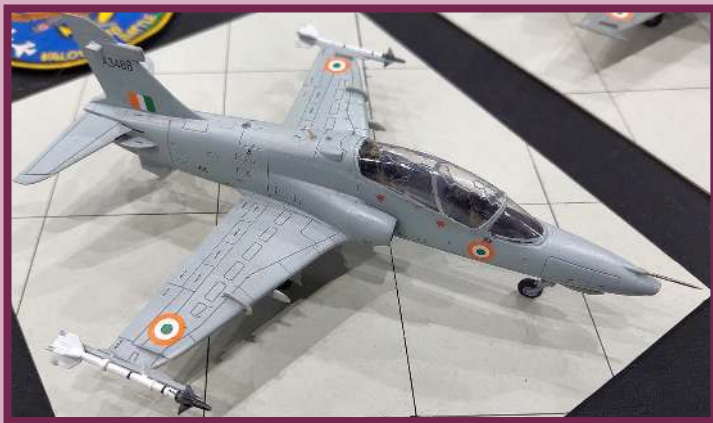
One of a huge selection of 1:72 scale BAe Hawk models that were presented on the BAe Hawk SIG tables to commemorate the 50 th Anniversary of the Hawk in military service. This particular model portrays an Indian Air Force BAe Mk.132.