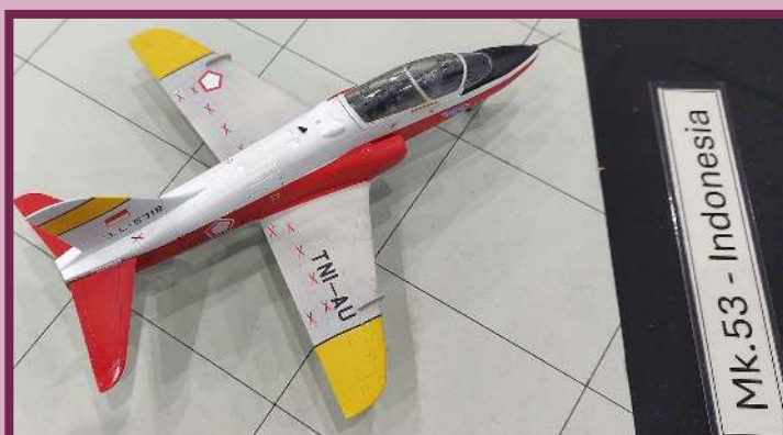
The BAe Hawk Mk.53 was the first variant delivered to the Indonesian Air Force (AURI), and was the equivalent of the original RAF BAe Hawk T.Mk.1. The aircraft sported a colour scheme that was broadly similar to the standard RAF training aircraft scheme, with the exception of the large yellow panels on the wingtips and fin, as portrayed on this rather nice 1:72 scale model.