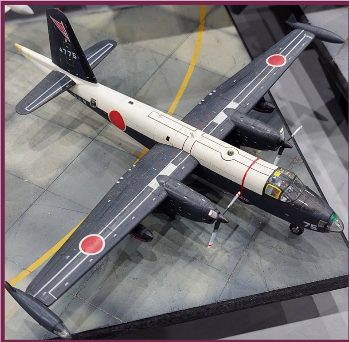
An excellent 1:144 scale model of the Lockheed (Kawasaki) P-2J Neptune, in the markings of the 2 nd Kokutai of the JMSDF, was spotted on one of the IMPS(UK) Club stands, together with the Iranian P-3 Orion shown on this page.