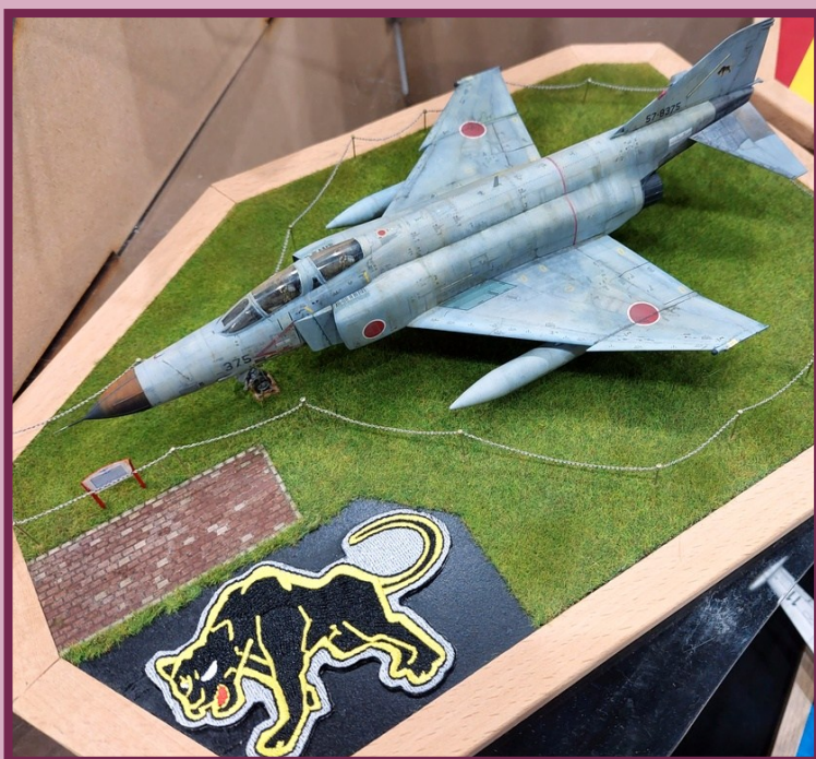
This 1:72 Scale McDD F-4EJ Kai Phantom II, built from the relatively new FineMolds kit, has previously featured in one of the monthly modelling periodicals so it was nice to see the vignette, portraying the aircraft in its current preserved state, as an exhibit at Telford.