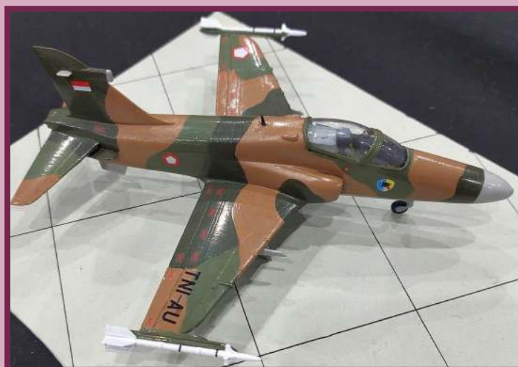
The Indonesian Air Force became a major user of the BAe Hawk, and later operated the single-seat Mk.209 variant, optimized for the Ground Attack and Point Defence roles. This is the old Matchbox 1:72 kit, which utilized aftermarket decals from Air Graphics, one of the AAA SIG sponsors.