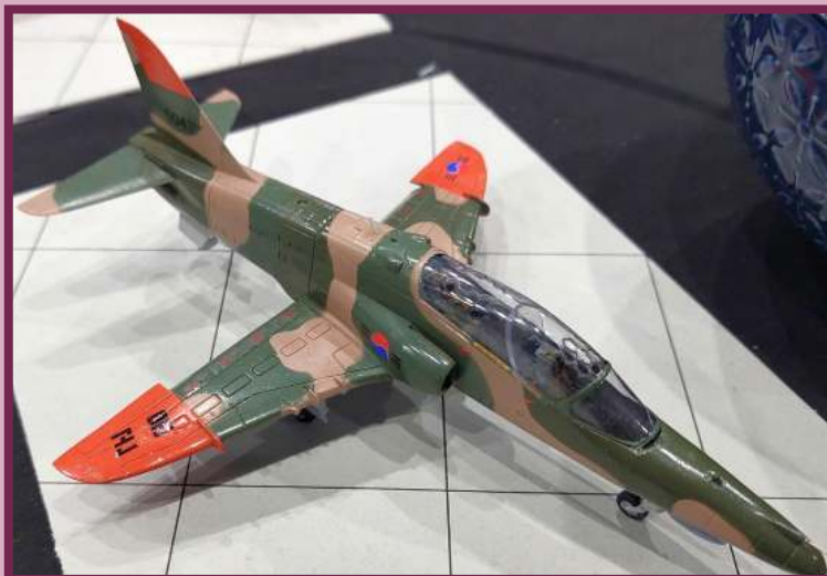
The Republic of Korea Air Force was a major user of the BAe Hawk and operated the rather unique BAe Hawk Mk.67, with its elongated nose. The high-visibility Orange markings contrast nicely with the standard ROKAF tactical camouflage scheme applied to these aircraft.