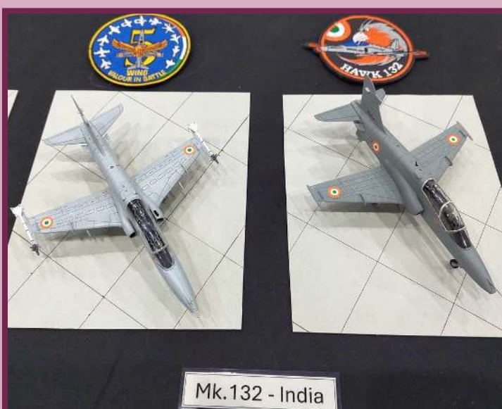
A nice pair of Airfix 1:72 scale models of the BAe Hawk Mk.132 in Indian Air Force colours. This view clearly shows the different interpretations of colour schemes that can be applied to a similar aircraft type.