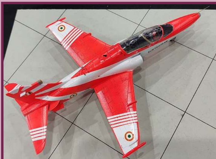
The Airfix 1:72 scale model of the Indian Air Force BAe Hawk Mk.132, on display with the BAe Hawk SIG. This particular models sports the markings of the 'Surya Kiran' Aerobatic Display Team, utilizing aftermarket decals that can be found in the current Air Graphics range.