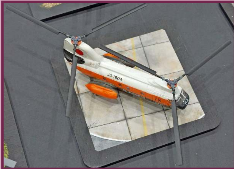
A highly unusual 1:144 scale Kawasaki KV-107, probably utilizing the F-Toys kit and finished in the markings of the JMSDF.