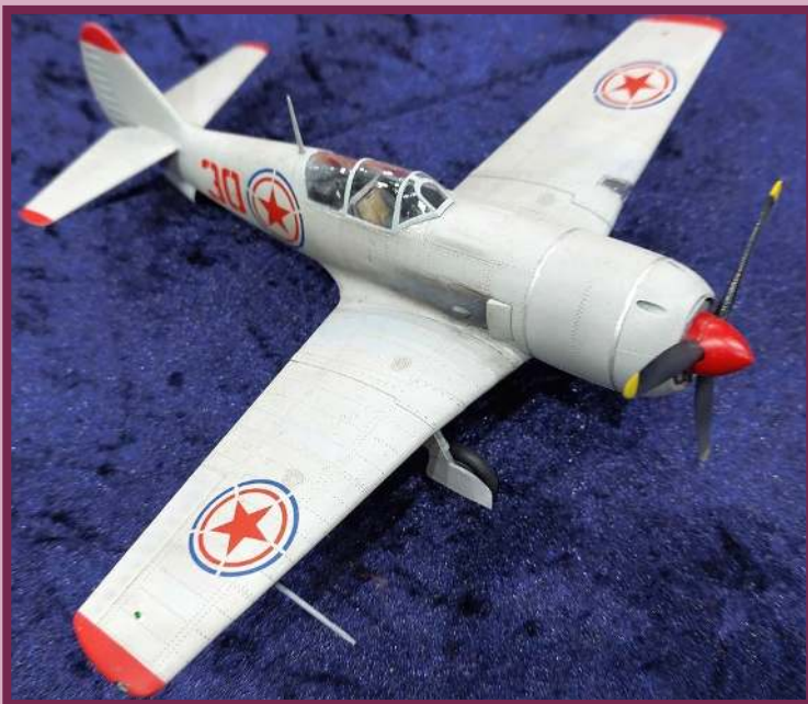
Completed models of the World War II era Lavochkin La-11 'Fang' are not often observed, so it was very pleasing to see this nice 1:48 scale example on show, which displayed the North Korean Air Force markings applied to aircraft that were actually flown by Russian pilots during the Korean War between 1950-53.

A very nice example of the classic Grumman F-14A Tomcat in the Islamic Republic of Iran Air Force (IRIAF) 'Asia Minor' camouflage scheme and markings, which had been reproduced using the Hobby Boss kit, was observed on one of the displays in the Overseas Branch Section at SMW'24.